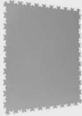
LIGHT GREY 7045