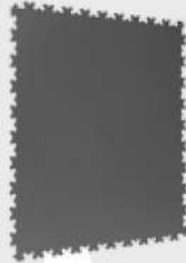
DARK GREY 7015