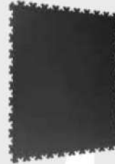
SLATE GREY 7016